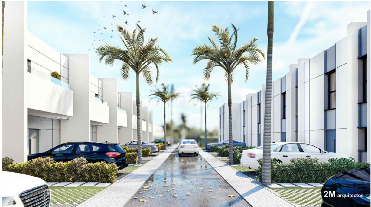
Real estate project