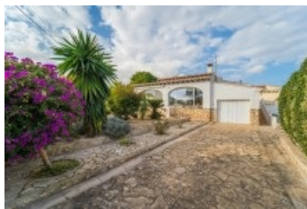
Beautiful 2-bedroom villa, ground floor, Calpe. Beautiful 2-bedroom villa, ground floor, Calpe Panoramic views over the town, Peñón de Ifach and the sea. This well maintained and in 2015 completely renovated villa consists of a spacious lounge-dining room with semi-open kitchen, 2 spacious bedrooms, one with bathroom en-suite, both bedrooms with fitted wardrobes, a second bathroom, indoor garage and large partly covered terraces. All rooms on the ground floor.&nbsp;The house comprises central heating, fireplace, double-glazed windows, cellar. Well maintained garden with several citrus trees, swimming pool (8x4m) with large terrace of over 70 m2 all around. Calpe is a small town of over 20,000