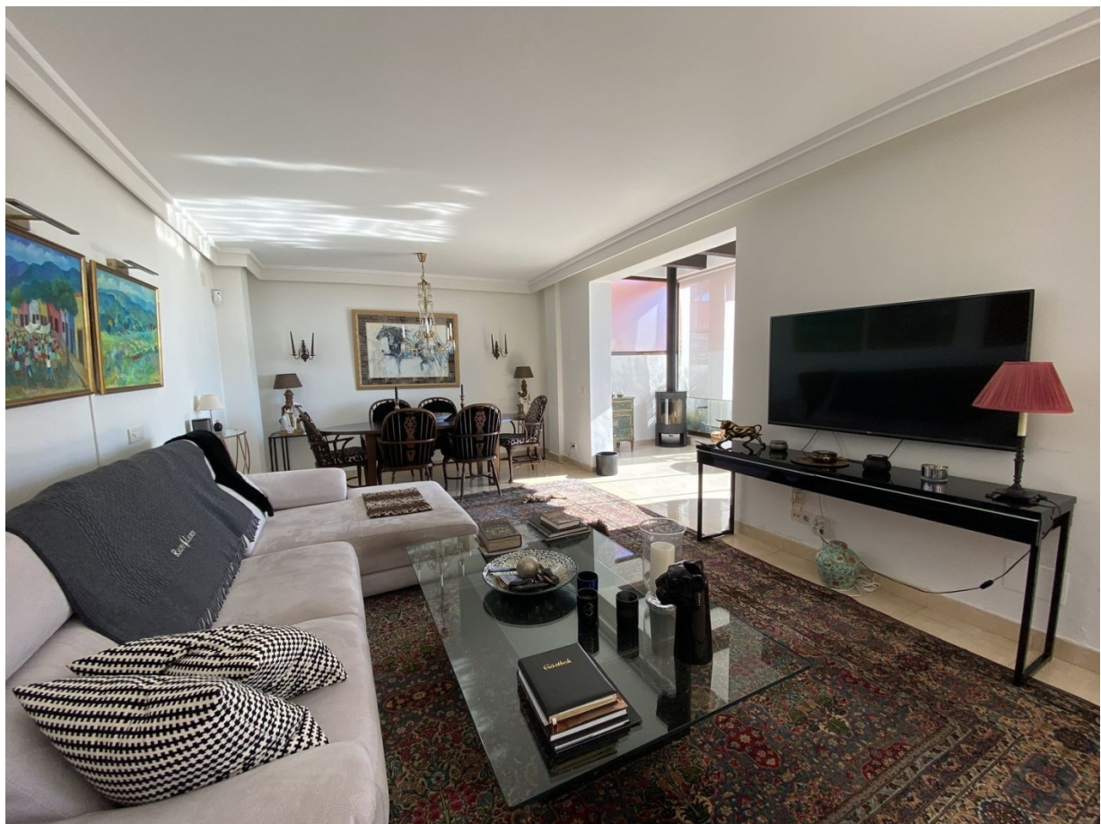
Living room with terrace.